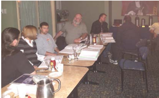
IN WHITEHORSE MEMBERS FROM AEROGUARD AND INLAND KENWORTH DEVELOP A STRATEGIC PLAN THAT THEY WANT TO BRING BACK INTO THEIR WORKPLACES

It has often been said that training activists is the back bone to a strong labour movement. If that is true the United Steelworkers take a back seat to no one. This past month we saw health and safety activists from Whitehorse to Winnipeg participate in health