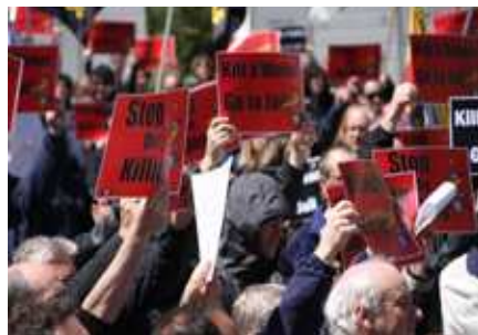
In Toronto workers demanded that the employers are held responsible